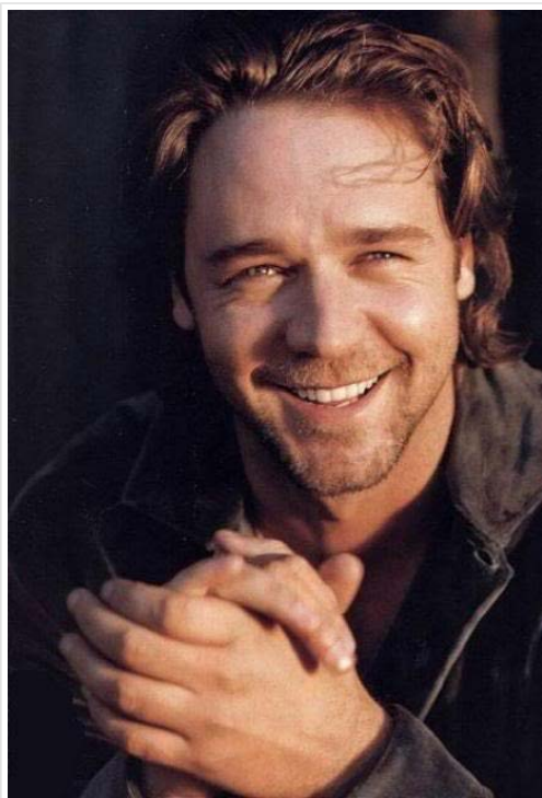
The one and only, Russell Crowe!